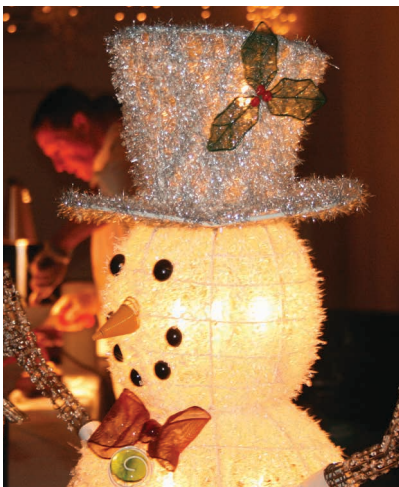
Lovely holiday decorations at the annual luncheon.

The Showcase, open to the entire QCC community, gave students the opportunity to present their work in a typical academic conference format and answer questions about their work. Many students reported that questions from QCC students, faculty and staff members helped them to hone their final paper and inspired them to submit their work to the 21st Annual Undergraduate Research Conference coming up in April 2015.