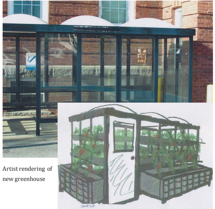
Artist rendering of new greenhouse

The cross-functional team has had several initial meetings and has come away with ideas for reconstructing the smoking hut with minimal structural work.